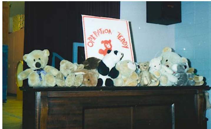
Figure 5 Bears on Piano Waiting for Concert to Begin

(Figures 5 and 6). Additional funds were granted from the local Soroptomist International Chapter and a newspaper column charity drive. The bears were provided at cost from a large California manufacturer.