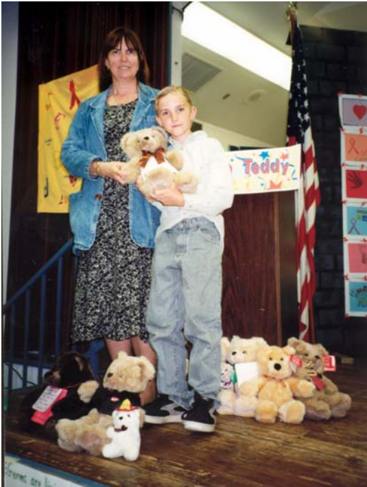
Figure 7 Student Ready to Donate Bear