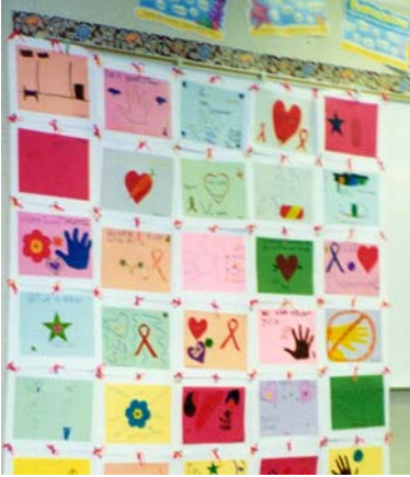
Figure 1 Construction Paper Quilt