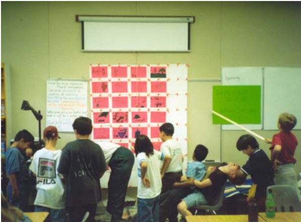
Figure 2 Children Hard at Work