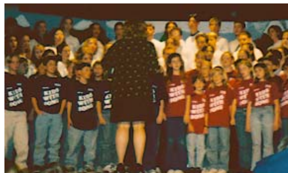
Figure 6 Fundraising Concert