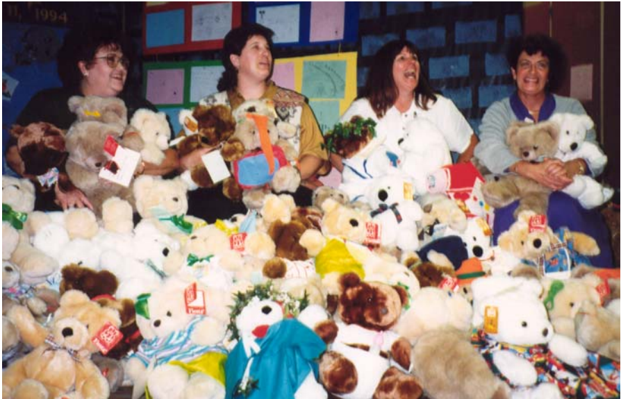
Figure 8 A Few Recipients of Donated Bears