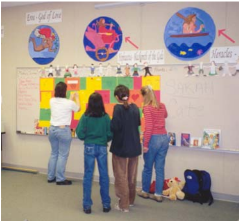
Figure 3 Girls Working on the Quilt